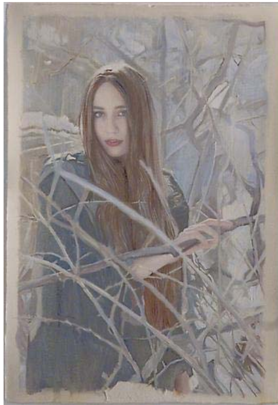
Yigal Ozeri, Untitled; Lizzie in the Snow (Study 12) 2010, Mixed media on paper, 18 x 12 3/4 inches (45.72 x 32.39 cm)