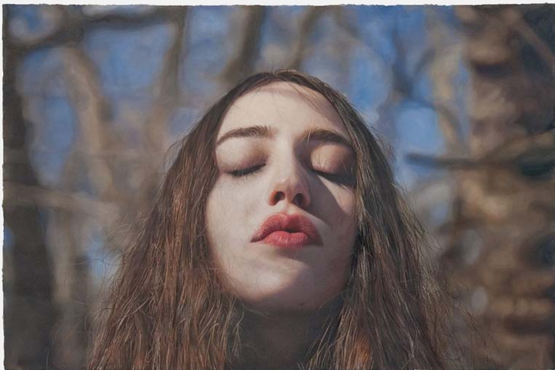
Yigal Ozeri, Untitled; Lizzie in the Snow (3) , 2010, Oil on paper, 42 x 60 inches (106.68 x 152.4 cm)