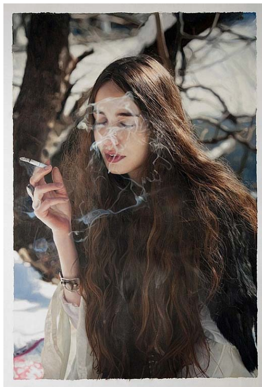
Yigal Ozeri, Untitled; Lizzie in the Snow (9) , 2010 Oil on paper, 60 x 42 inches (152.4 x 106.68 cm)