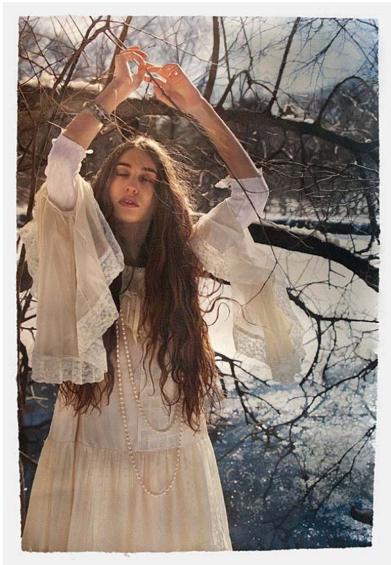
Yigal Ozeri, Untitled; Lizzie in the Snow (10) , 2010 Oil on paper, 60 x 42 inches (152.4 x 106.68 cm)