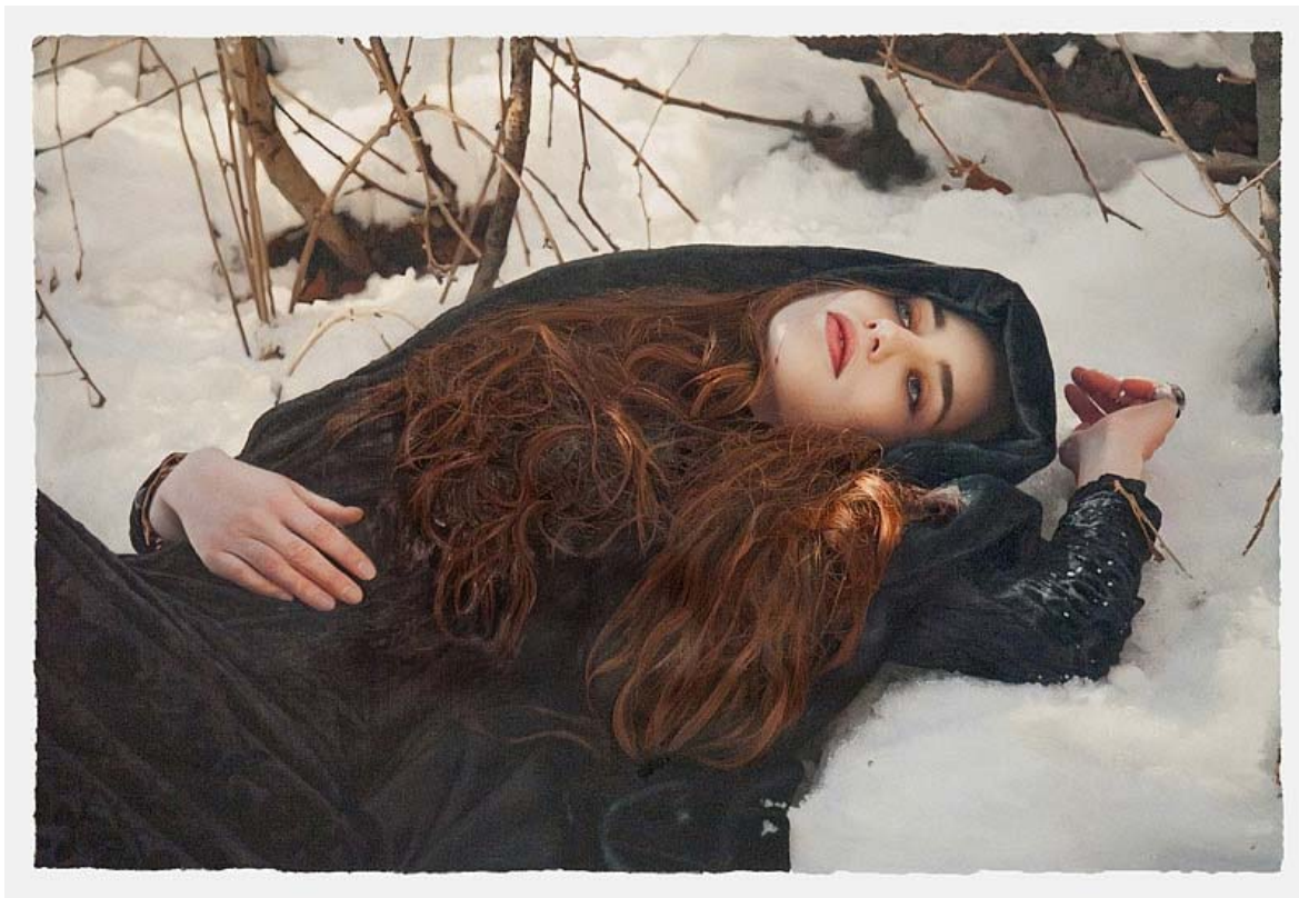
Yigal Ozeri, Untitled; Lizzie in the Snow (5) , 2010, Oil on paper, 42 x 60 inches (106.68 x 152.4 cm)