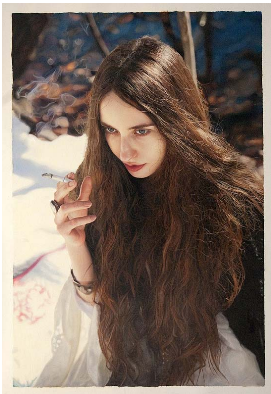
Yigal Ozeri, Untitled; Lizzie in the Snow (8) , 2010 Oil on paper 60 x 42 inches (152.4 x 106.68 cm)