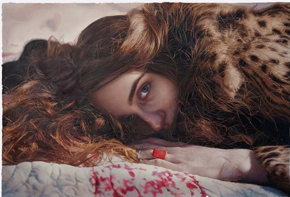
Yigal Ozeri, Untitled; Lizzie in the Snow (1) , 2010, Oil on paper, 42 x 60 inches (106.68 x 152.4 cm)