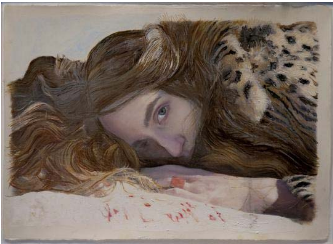
Yigal Ozeri, Untitled; Lizzie in the Snow (Study 1) , 2010, Mixed media on paper 12 3/4 x 18 inches (32.39 x 45.72 cm)