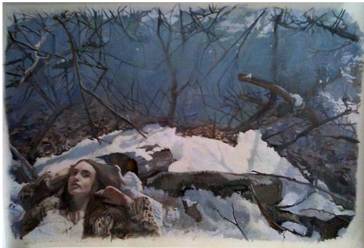
Yigal Ozeri, Untitled; Lizzie in the Snow (Study 2) , 2010, Mixed media on paper, 12 3/4 x 18 inches (32.39 x 45.72 cm)